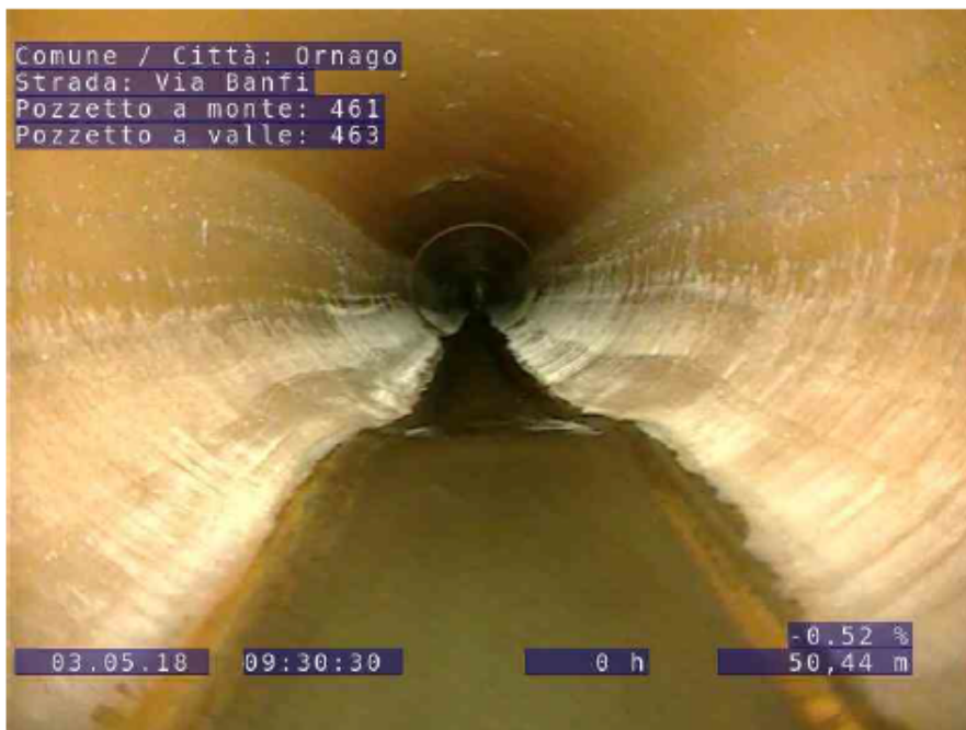
13, 00:15:40, 50.44 Nota generale