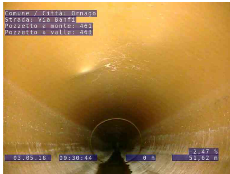
14, 00:15:51, 51.62 Nota generale

Comune / Città: Ornago Strada: Via Banfi Pozzetto a monte: 461